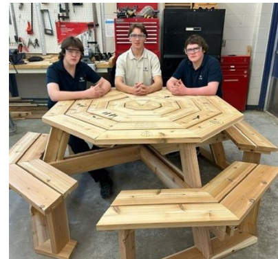
Students Construct Picnic Tables for Healing Place Garden