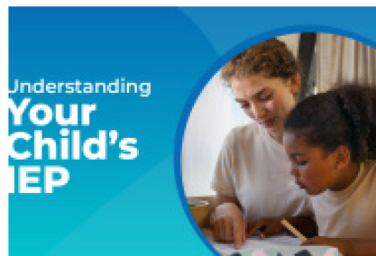
Understanding Your Child's IEP